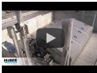
Video: HUBER Disc Filter RoDisc® https://www.youtube.com/watch?v=PemmdFxbUEs